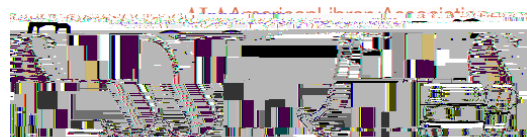
ort Staff Interests Round Table Library Supp