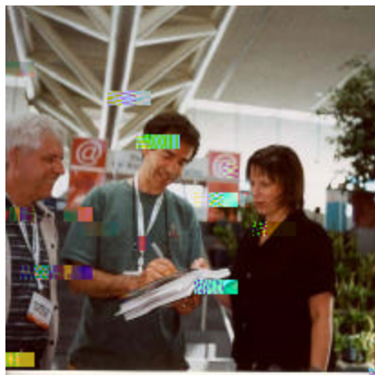
IRRT volunteers and international librarians at the International Visitor Center at 2001 ALA Annual in San Francisco.

Saturday, June 15, 2:00 - 4:00 p.m. Georgia World Congress Center - Room B213