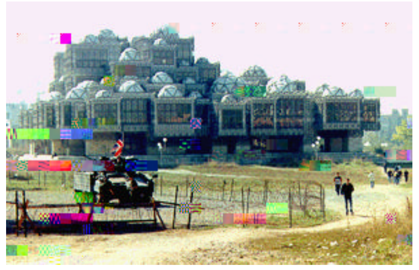
The National and University Library of Kosovo, Prishtina, with a British KFOR armored vehicle in front.

Institute of History, were taken over and used as command and control centers by the Yugoslav Army. Fortunately, neither the State Archives nor the National Library building were hit by bombs or missiles during the air war, but when the Yugoslav military departed, it