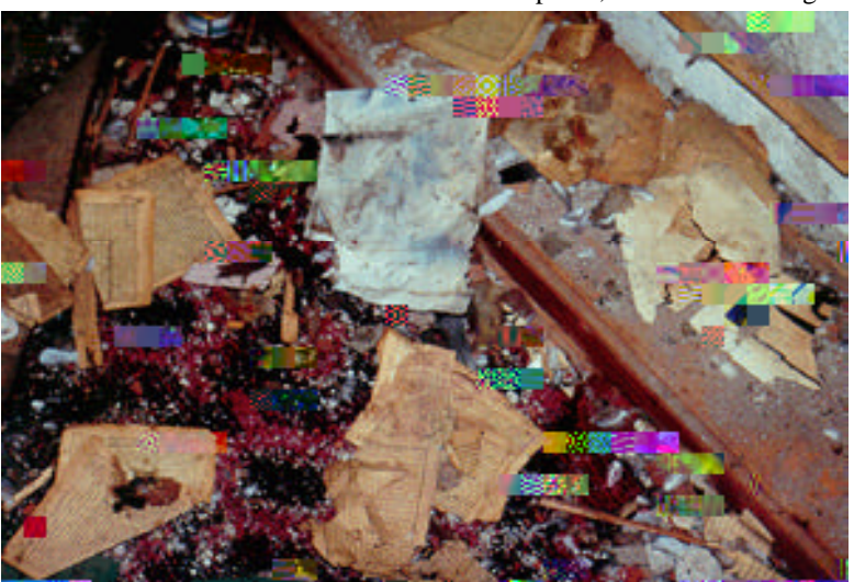
Torn-up and burned religious books and manuscripts in a village mosque, Crnoljevo. (Photo: Andras Riedlmayer, October 1999)

Presumably, control of these records will also make it possible for the Belgrade government to selectively add to, remove or alter documentation to suit its own purposes. Meanwhile, hundreds of thousands of Kosovars who were deprived of their personal documents when they were expelled in the spring of 1999, whose passports or licenses have expired, who wish to register a