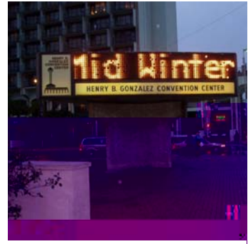
San Antonio welcomes ALA

While there was no easy answer, the group found the discussion helpful. There was also the suggestion that small groups of librarians meet informally with vendors at conventions so that they can make their needs known.