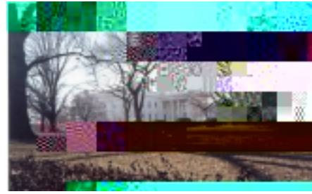
The White House